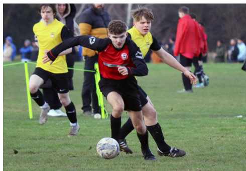
Amongst our other Junior results our U18 Reds (pictured above) fell to defeat, but there were wins for our U8 Reds, U12s, and on Saturday our U12 Girls team won their first ever match with a 3-1 result.