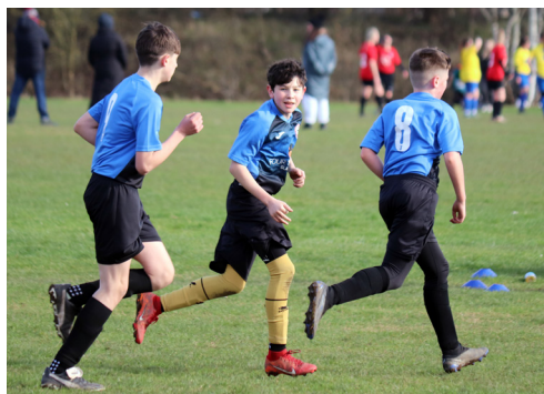
Our U13s were in action last weekend against Pinfold Pumas. Pictured above are three of the team celebrating their first goal.